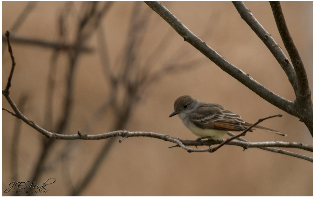
17 Nov '19 Ash-throated Flycatcher (4).jpg