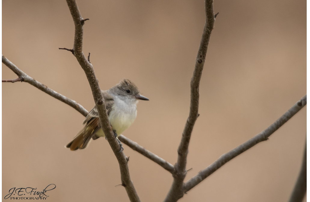
17 Nov '19 Ash-throated Flycatcher (1).jpg