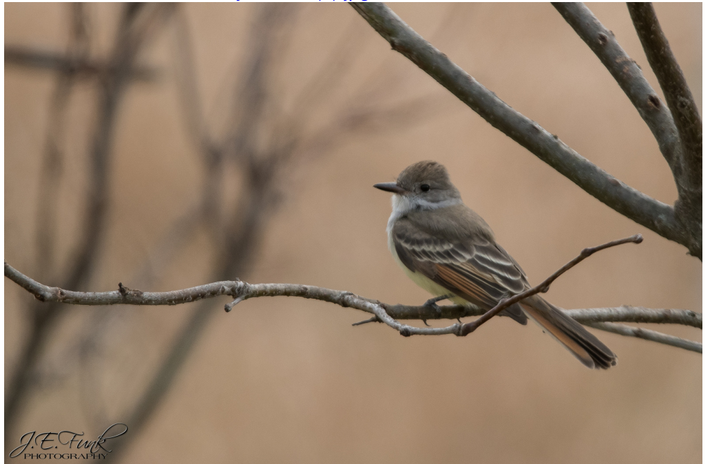
17 Nov '19 Ash-throated Flycatcher (3).jpg